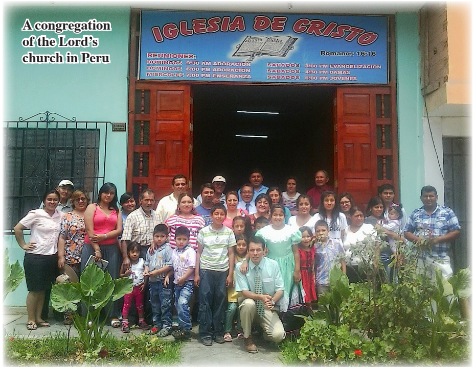
A congregation of the Lord's church in Peru

new Christians to grow in their faith in the Lord. The courses in the school will also be of invaluable assistance to preacher training schools, missionaries, short-term mission efforts, medical missions, and personal work in America and throughout the far reaches of the earth. This online Bible-study school will join hands with all the Christian works, giving them the essential follow-up that is always needed.